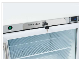
Main switch, digital thermostat and door lock fitted as standard