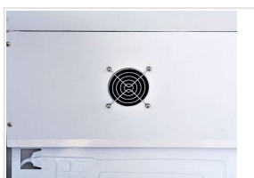
Inner assistance fan